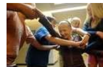
First Day in Sixth Grade