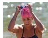
Horsetooth Open Water Swim