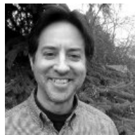
V l q f h u o j / Z l a #z d o h w F k d l v #v l u u d #F o x e #U r f n | #P r x q w l q #k d s w h u

S I V #S d d v h #k d u h #k l v #p s r u w d q w #v x h #z l k #| r x u #i u h q g v #i d p l c | #i q a #f r a n d j x h v l